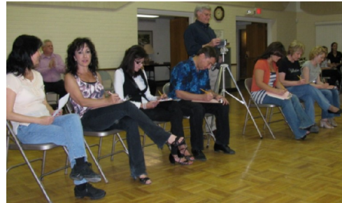
Judging the March J&J