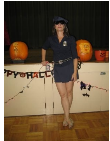
Yes, there really is a dance police...