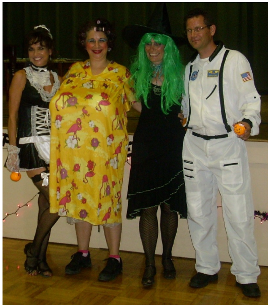
The costume contest winners!