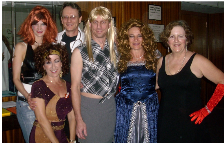
Thanks to everyone who dressed up!