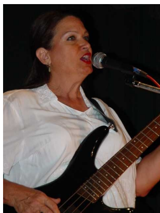
'Blues Cubed' played at The Tucson Swing Dance Club on January 18th 2007