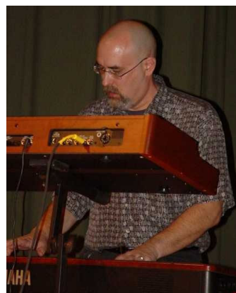
A good time was had